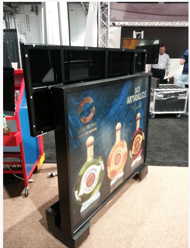
It Folds It Rolls It Lighter Up... ITS CUSTOMIZABLE