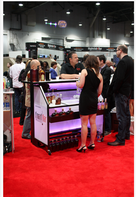
SmartBar 5L - The Premier Portable Bar!

As they celebrate this momentous occasion, they invite all of their customers and supporters to celebrate with them. Come and explore their website and see how the flagship full size professional portable bar SmartBar 5L functions at various events www.smartbarproducts.com Its top of line construction and promotional opportunity gives owners the ability to make a profit by advertising logos & event imagery on the removable customizable panels. The SmartBar 5L comes with 2 ice bins, 2 cutting boards, a speedwell, inside upper folding shelf, wheel covers that come attached and fold with the bar and a heavy duty protective furniture cover. It's made of heavy duty yet lightweight metal in black or white frames. It comes with multi-color programmable LED lighting as well. SmartBar 5L is built with 6 wheel casters. It has 4 locking wheels in the front and 2 locking wheels in the back. It requires no tools to set up! The top counter comes attached and folds with the bar and it sets up and tears down in less than 20